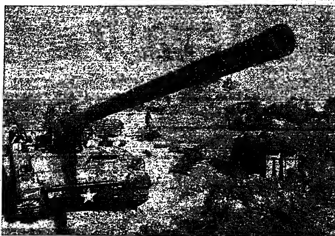
DOMINEERING—A self-propelled 8-inch gun is the focal point in this view of a newly constructed U.S. fire support base in the Central Highlands of South Vietnam.

Orders over $100 can be shipped at Danish export prices.